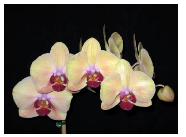
May 17-19 Redland International Orchid Festival Homestead, FL